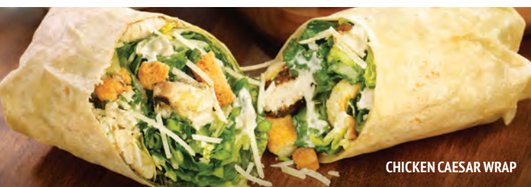
CHICKEN CAESAR WRAP

SMALL serves 25-30 49.99 / LARGE serves 50-55 95.99